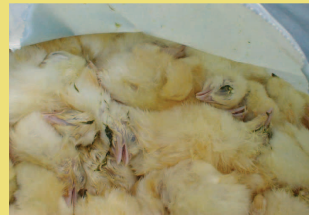
Male Chicks Suffocated in Trash Bags

Along with defective and slow-hatching female chicks, they are trashed as soon as they hatch. Upon breaking out of their shells, instead of being sheltered by a mother's wings, the newborns are