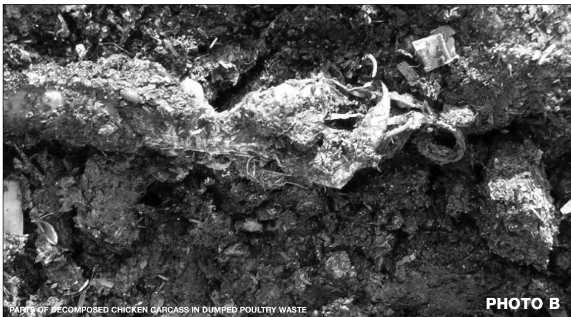
PARTS OF DECOMPOSED CHICKEN CARCASS IN DUMPED POULTRY WASTE