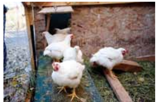
These sweet birds were brutally killed by the students.