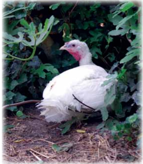
UPC sanctuary turkey, Amelia, sits quietly in her favorite nesting place.