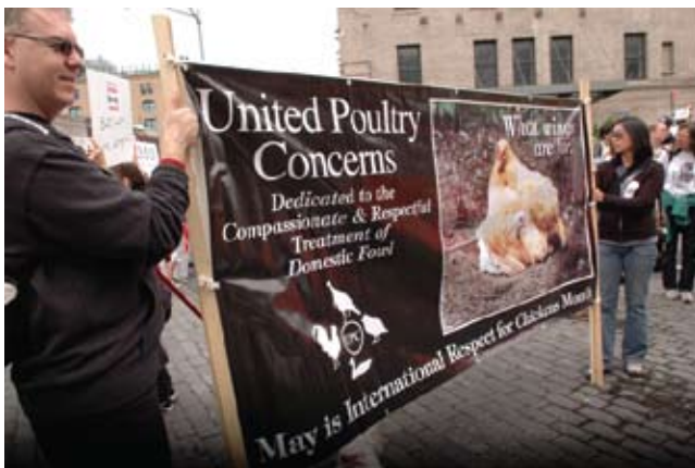
UPC activists Franklin Wade & Liqin Cao marched for chickens in 2008